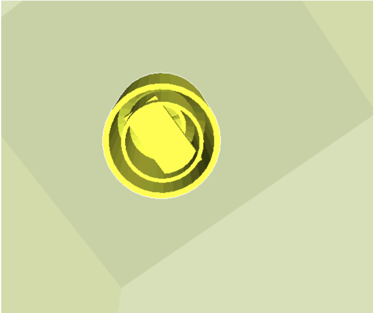
Structure viewed in Cura from bottom (normal view).